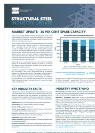
SCNZ's eighth Structural Steel Industry Update

Please take a moment to look at the Structural Steel Industry Snapshot and share it with your networks.