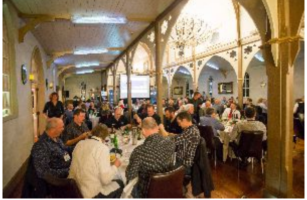
Delegates enjoying the gala dinner