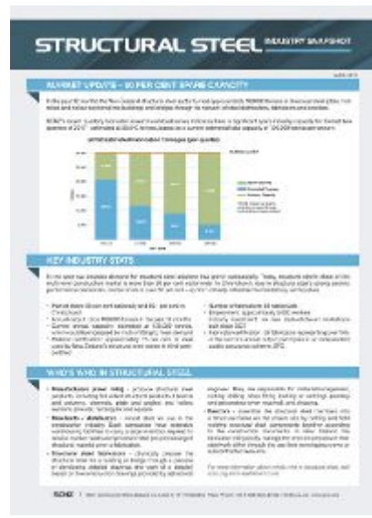
SCNZ's third Structural Steel Industry Snapshot

This bi-annual report contains solid data on industry capacity, lead times, market share etc. and is a key tool in SCNZ's drive to convince the market that our industry has the capacity to satisfy demand.