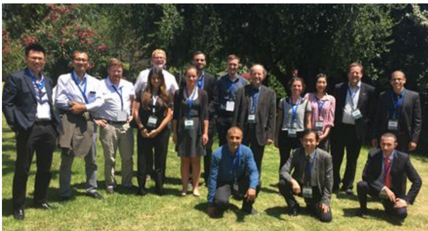
WCEE BRB International Collaboration Meeting

The research was well received and feedback will be incorporated into a paper presented at the New Zealand Society of Earthquake Engineering Conference in April.