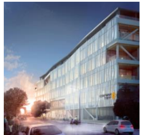
PWC Centre, Christchurch

The report describes a study conducted to quantify the extent to which various types of structural systems have been used in new buildings constructed by early 2017; and to identify some of the drivers that have influenced decisions about the selection of structural material and specific structural systems. The study involved a series of interviews with the structural designers of up to 60% of the post-earthquake buildings constructed to date in Christchurch's CBD.